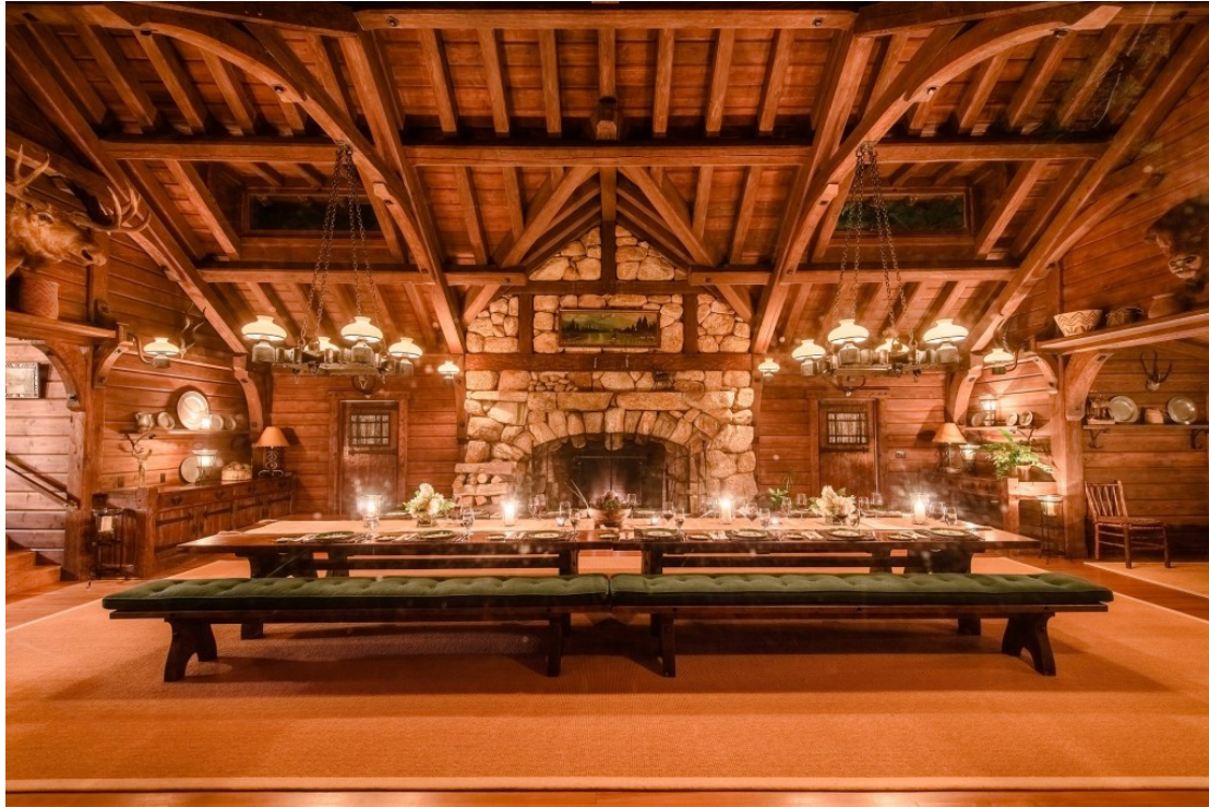
The dining room at Lake Kora, which can be entirely bought out for up to 35 guests.

For all the environmental wreckage of the industrial revolution, its elite loved to get back to nature. Near remote Raquette Lake, NY, in the Adirondacks, Lake Kora ( LakeKora.com ) "Great Camp" was built in 1898 for Timothy Woodruff, Lieutenant Governor of New York, as an exclusive back to nature retreat.