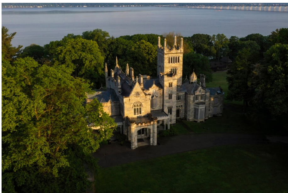
Robber baron Jay Gould had his heart stolen by Lyndhurst.

Erie Railroad head Jay Gould, an oft-called “robber baron,” could have built any palatial manse he desired from scratch, but he fell in love with Lyndhurst ( Lyndhurst.org ) in Westchester County, NY, and snapped up the Tarrytown house in 1880 as his country home. Built on 67 acres, Lyndhurst is a preeminent example of American Gothic Revival architecture, utterly packed with design details, including (the fashionable at the time) faux-marble and Gothic carvings.