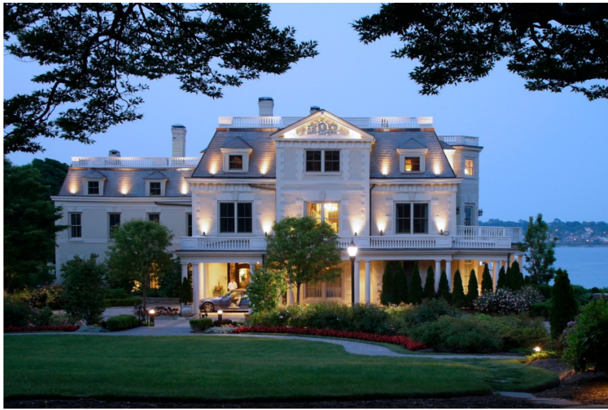
Rooms at the Chanler go from $615 a night.

The location on Newport's famous Cliff Walk overlooking the Atlantic Ocean isn't to be sniffed at, and the 20 unique rooms — the Renaissance Room has a sunken tub — are designed for full-on cossetting, including an aromatherapy bath service. Just call and a perfectly hot, fragrantly therapeutic bath is drawn at your pleasure. Room rates from $615 per night.