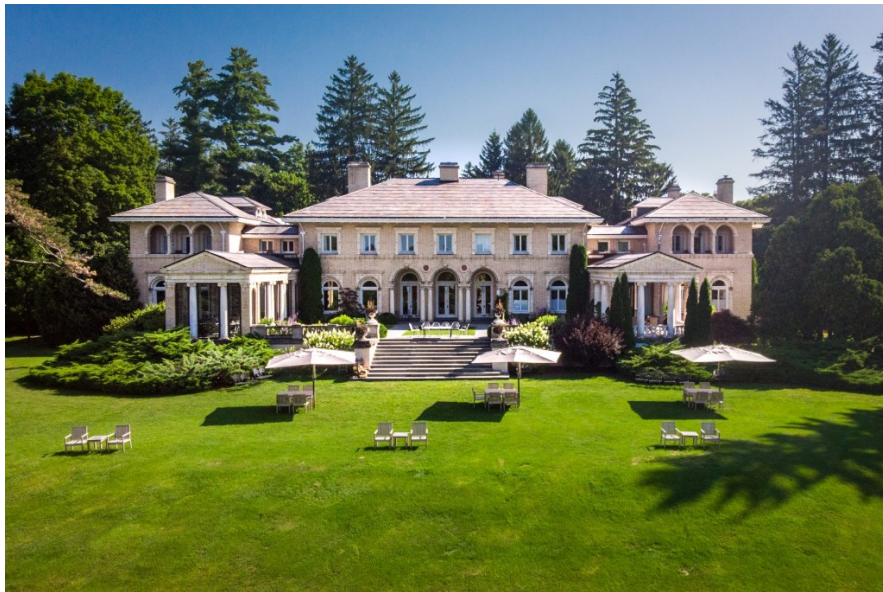
There are but 19 luxurious rooms and suites at the Wheatleigh.