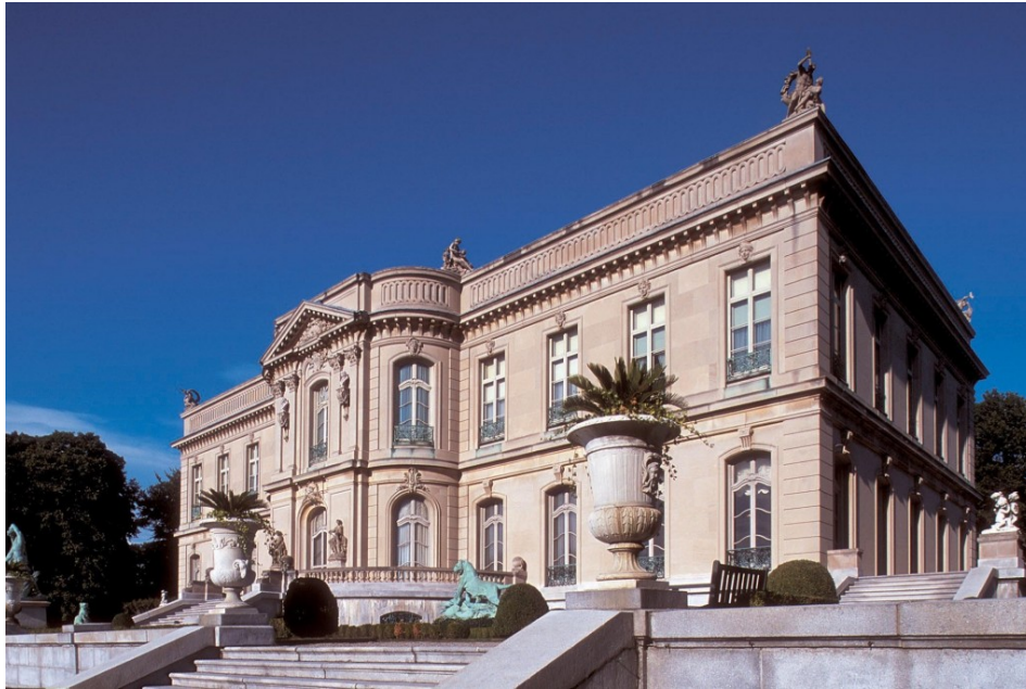
The Elms makes a cameo in the HBO series. John Corbett

But best off all, many of these glitzy getaways from the show are open to the public.