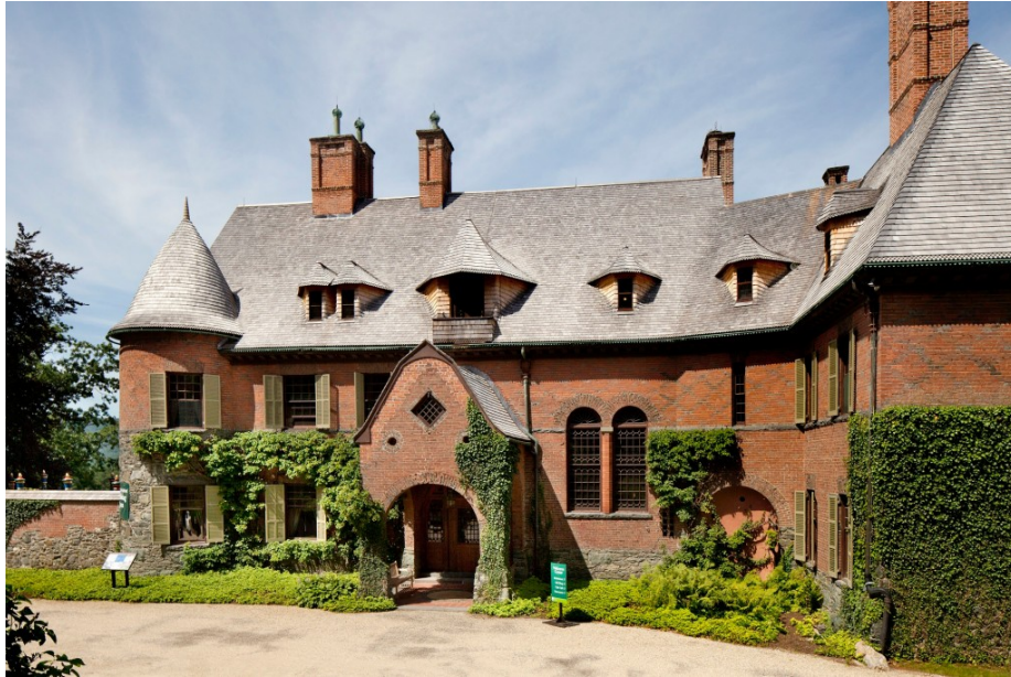
Naumkeag sits amid 40 acres of forest in